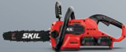
PWRCORE 20™ CHAIN SAW