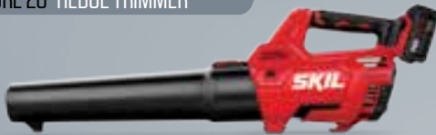
PWRCORE 20™ BLOWER