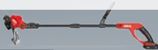
PWRCORE 20™ LINE TRIMMER