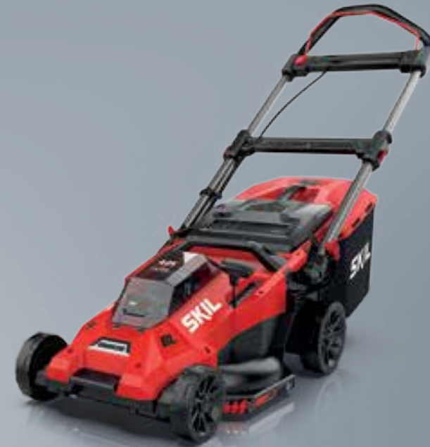
PWRCORE 20™ MOWER